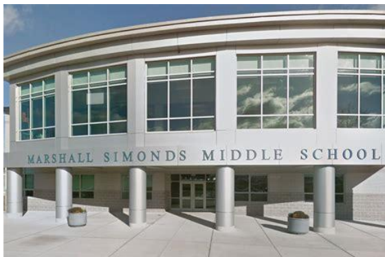
Marshall Simond's Middle School